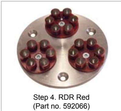
Step 4. RDR Red (Part no. 592066)