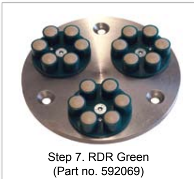
Step 7. RDR Green (Part no. 592069)