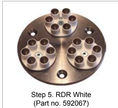
Step 5. RDR White (Part no. 592067)