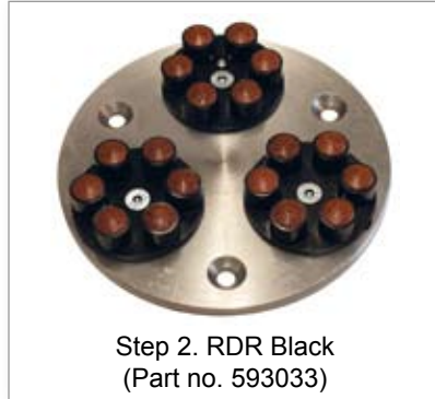
Step 2. RDR Black (Part no. 593033)