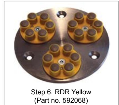
Step 6. RDR Yellow (Part no. 592068)