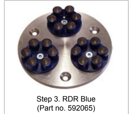
Step 3. RDR Blue (Part no. 592065)